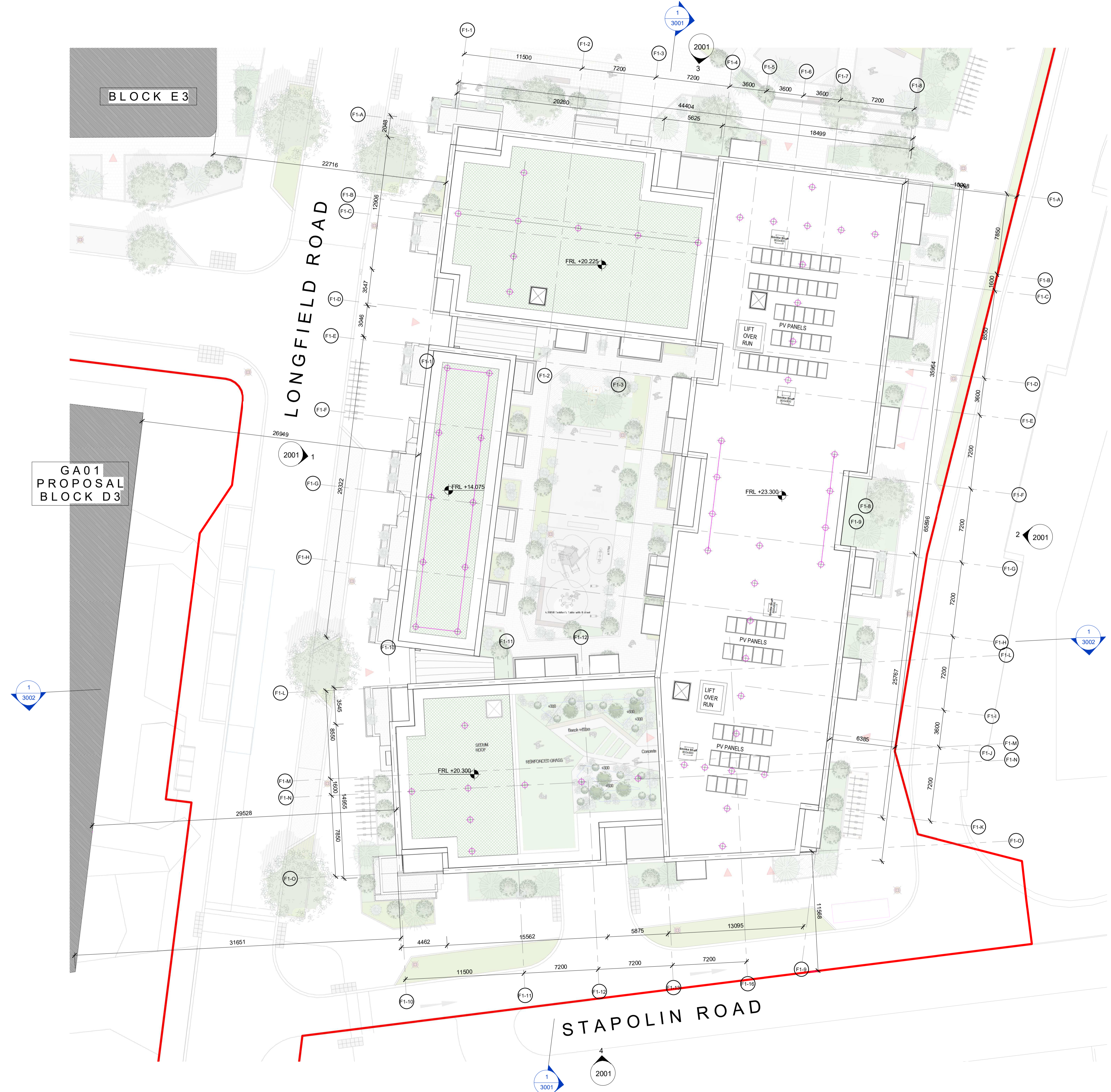
L05 - ROOF PLAN 1:200

Architecture + Interiors henrylyons.com +353 1 888 3333 info@henrylyons.com 51-54 Pearse Street Dublin D02 KA66